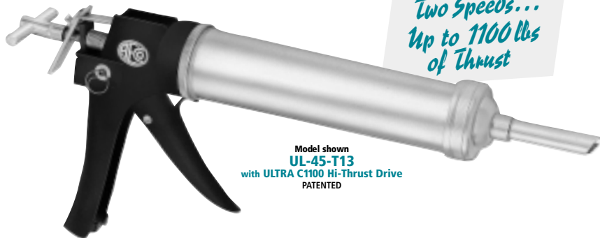
Model shown UL-45-T13 with ULTRA C1100 Hi-Thrust Drive PATENTED